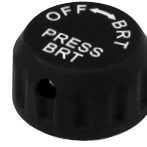
785 x=.94 y=.50