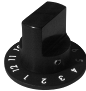
FNA 39193 x=1.26 y=.86