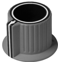
4110 x=1.50 y=1.00

All of our backlighted knobs can be manufactured for night vision use. Our night vision knobs meet NVIS "Green A" requirements.