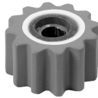
3142 x= 1.00 y= .56