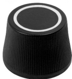
1992 x= 1.06 y= .75