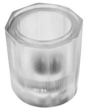
760 x= 1.00 y= 1.35