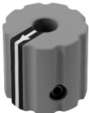
548 x=.90 y=.85