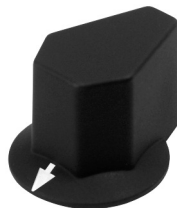
2899 x= 1.12 y= .81