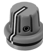
3180 x= 1.00 y= .91