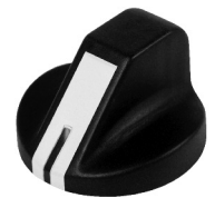
586 x= 1.15 y= .67

All of our backlit knobs can be manufactured for night vision use. Our night vision knobs meet NVIS "Green A" requirements.