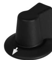
780 x= 1.12 y= .81