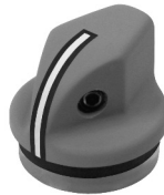
3840 x= 1.00 y= .87