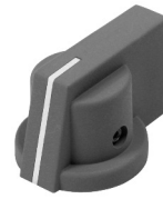
557 x=.77 y=.65