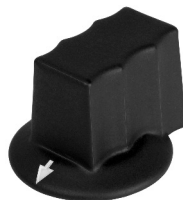
2175 x= 1.12 y= .81