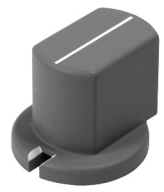
4014 x=.88 y=.75